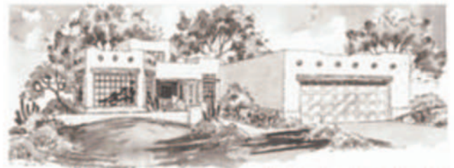
Exterior Design D