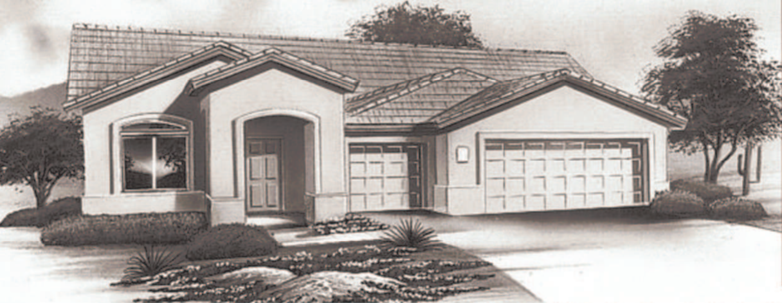
3 Bedrooms, 2-1/2 Baths, 2559 Livable Sq. Ft. - Exterior Design-B